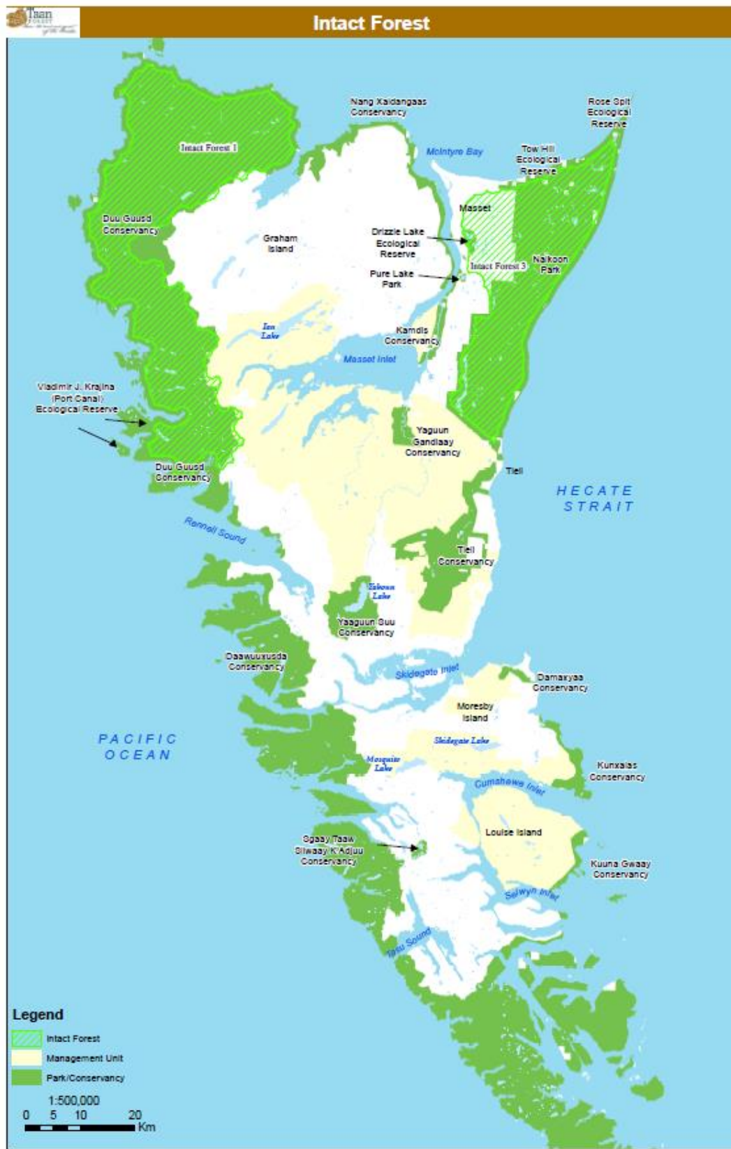
Figure 3: Regionally Significant Intact Forests >50,000

CONSIDER PRINTED COPIES OF THIS DOCUMENT UNCONTROLLED. CHECK THE INTRANET TO ENSURE YOU HAVE THE CURRENT VERSION.