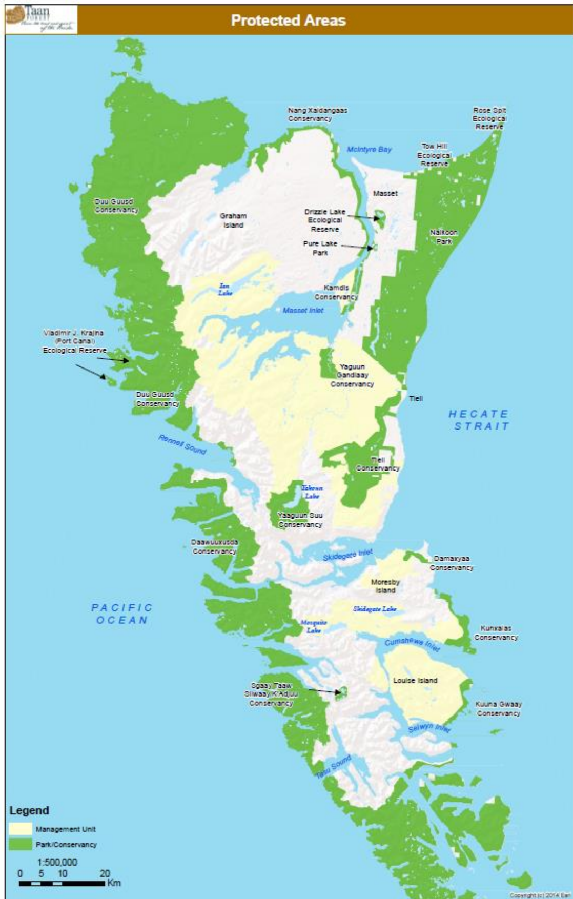
Figure 2: Map of Haida Gwaii Protected Areas

CONSIDER PRINTED COPIES OF THIS DOCUMENT UNCONTROLLED. CHECK THE INTRANET TO ENSURE YOU HAVE THE CURRENT VERSION.