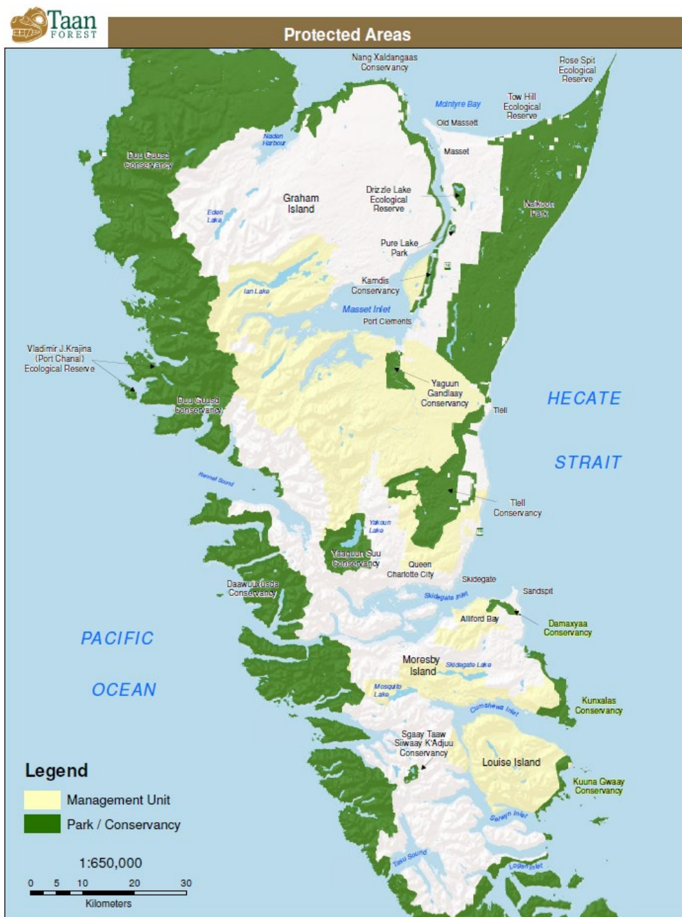
Figure 2: Map of Haida Gwaii Protected Areas

CONSIDER PRINTED COPIES OF THIS DOCUMENT UNCONTROLLED. CHECK THE INTRANET TO ENSURE YOU HAVE THE CURRENT VERSION.