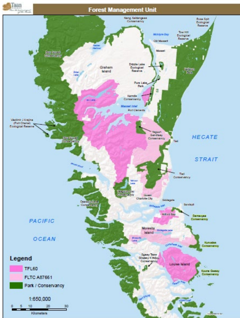
Figure 1: Map of the Management Unit

CONSIDER PRINTED COPIES OF THIS DOCUMENT UNCONTROLLED. CHECK THE INTRANET TO ENSURE YOU HAVE THE CURRENT VERSION.